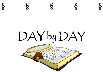
The May | June | July issue of DAY by DAY [Forward] is now available in the Narthex Tract Rack.