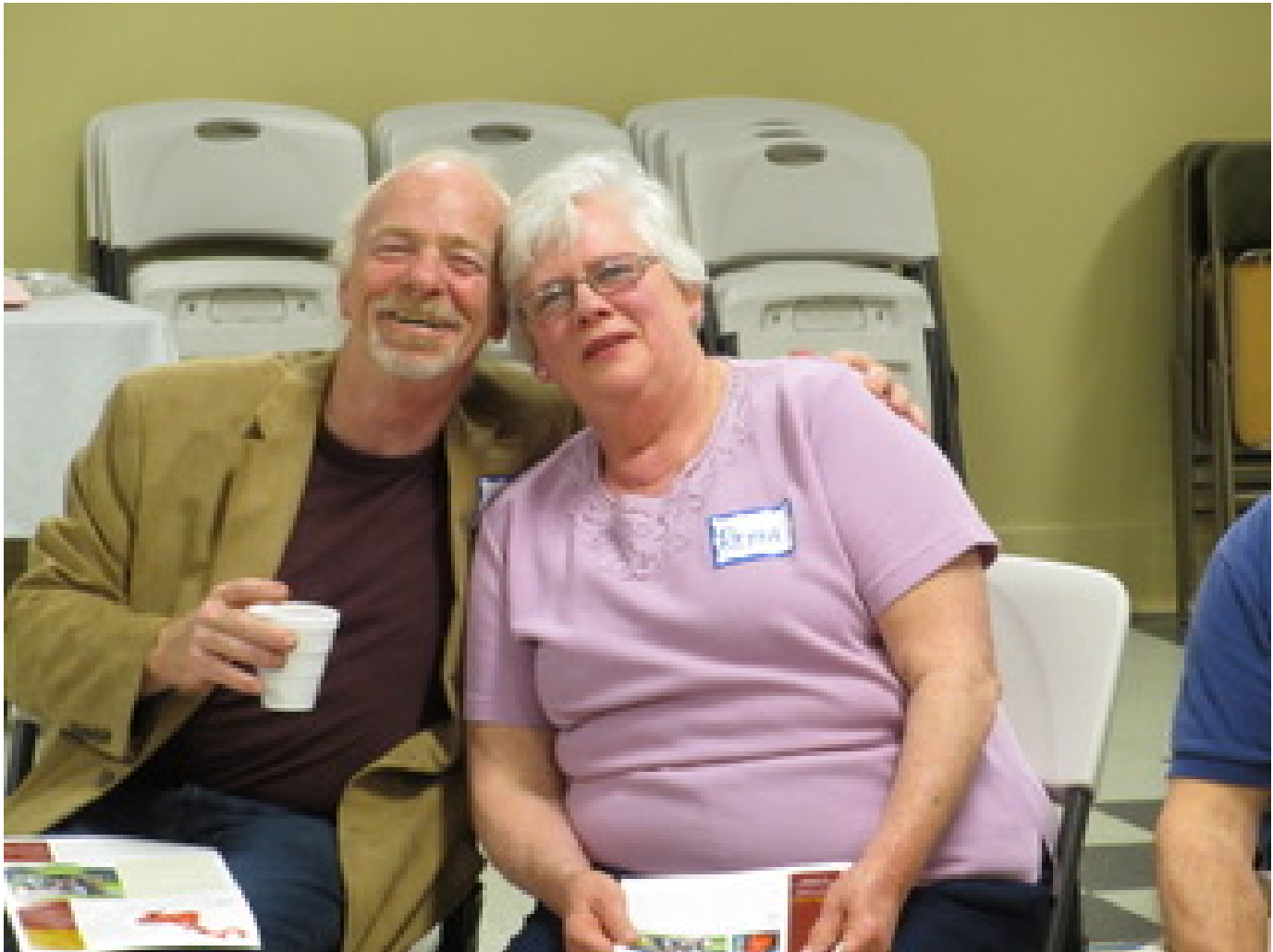
Just one of the boys.